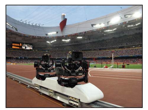
Olympics - Beijing