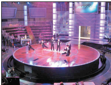
America's Best Dance Crew